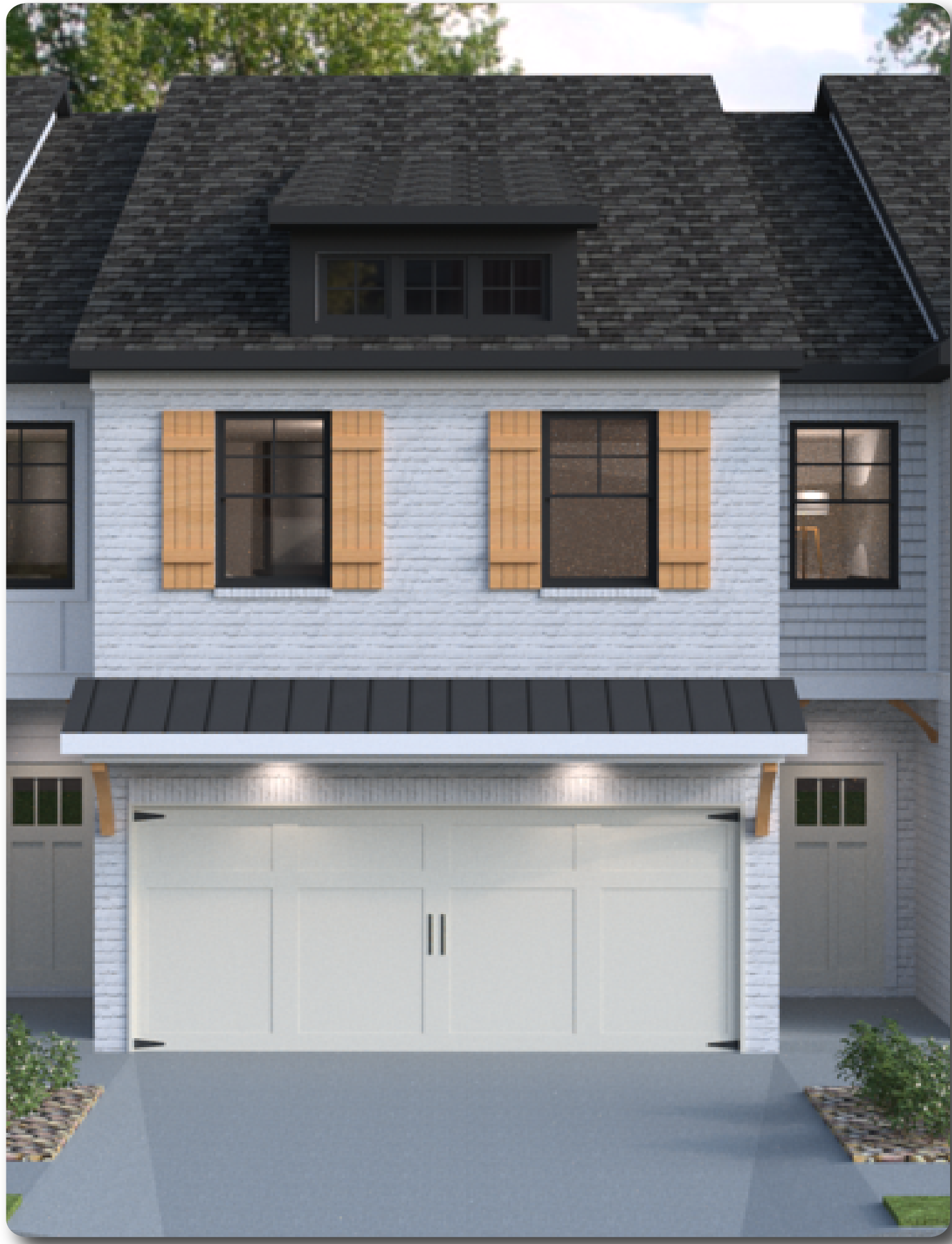
Redland Elevation J