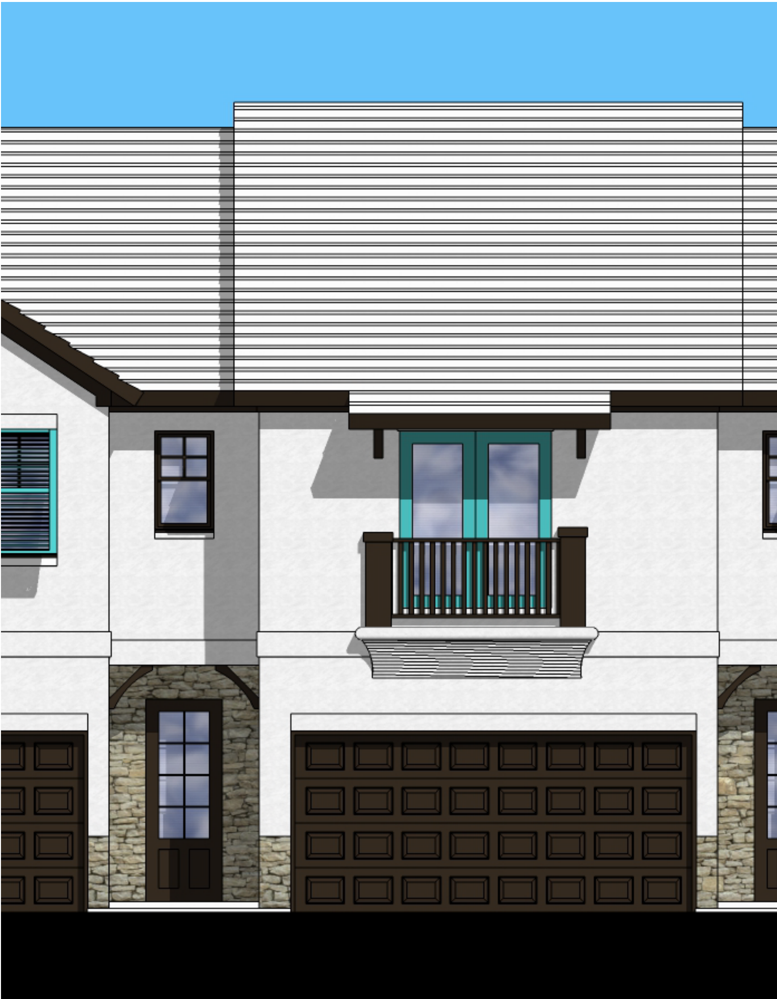
Stan iel elevation C