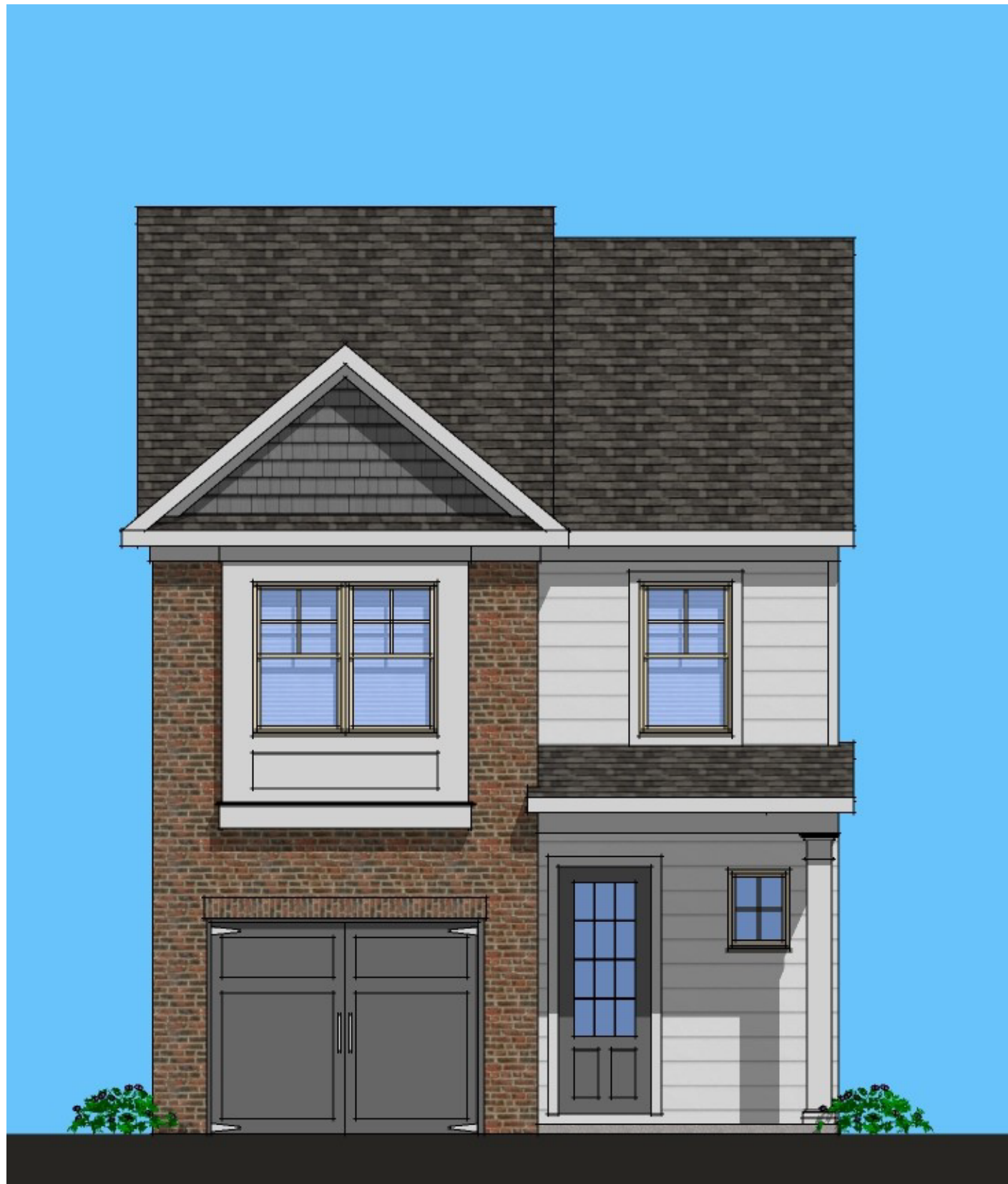
McIntosh elevation B