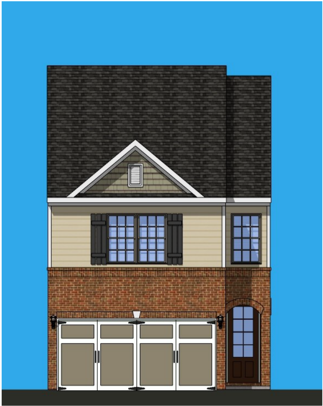
Redland elevation A