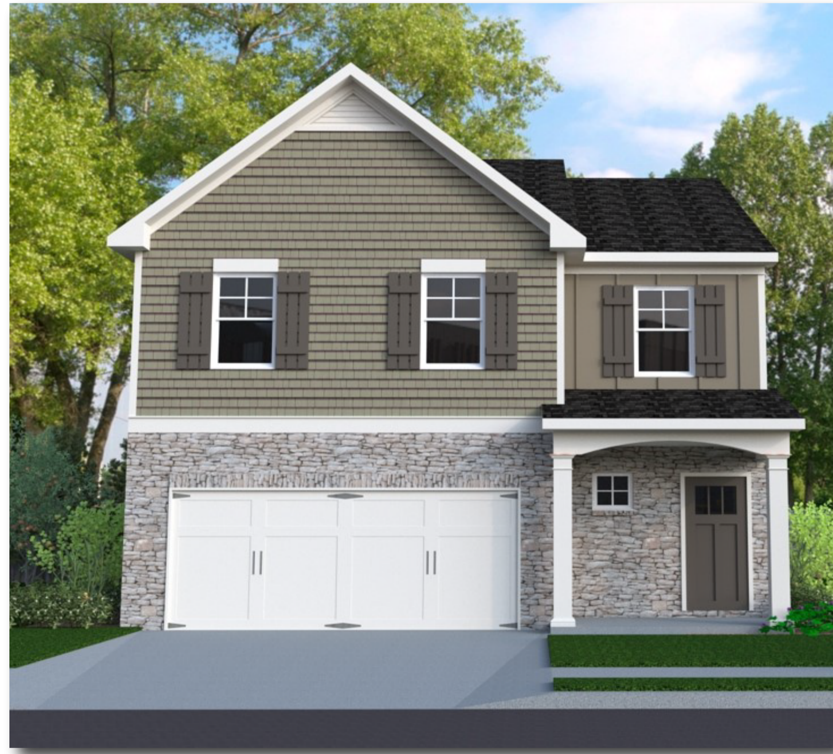
Briscoe Elevation A